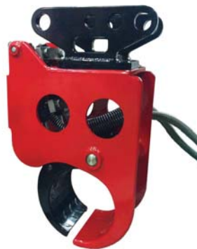
Midi Pipe Handler 6" Pipe Only