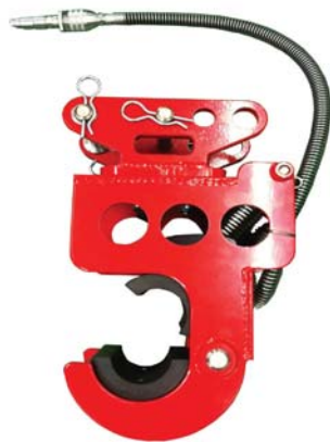
Mini Pipe Handler 2"-4"

5 Models are Available for 2" through 24" PE Pipe.