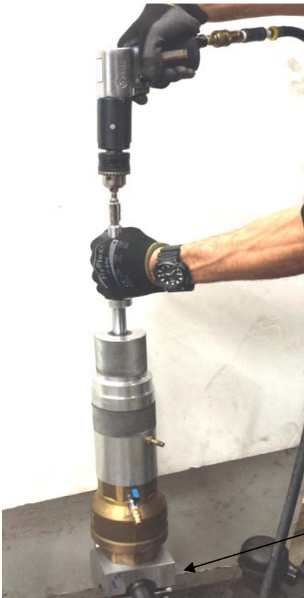
Tool Assembled on Elbow